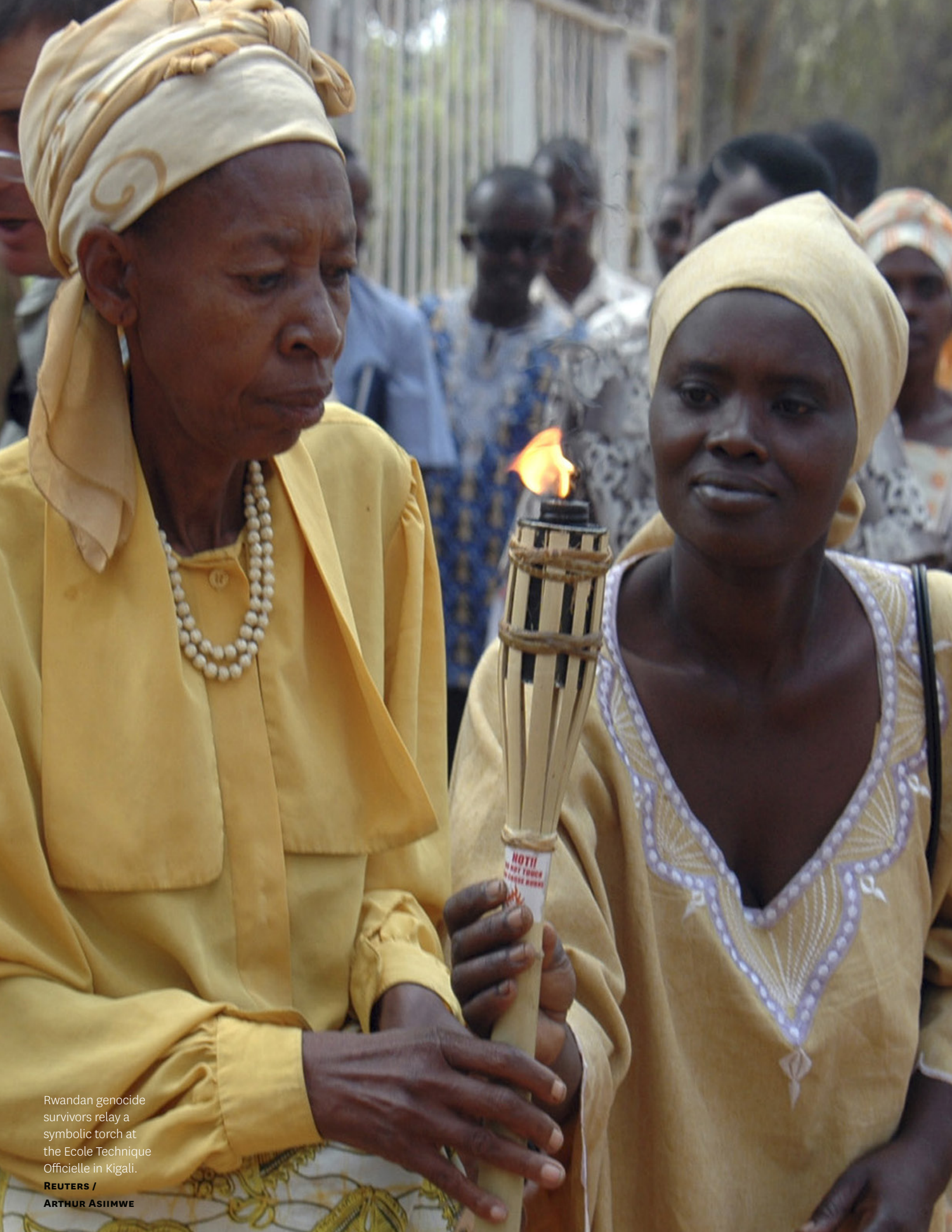
Rwandan genocide survivors relay a symbolic torch at the Ecole Technique Officielle in Kigali.