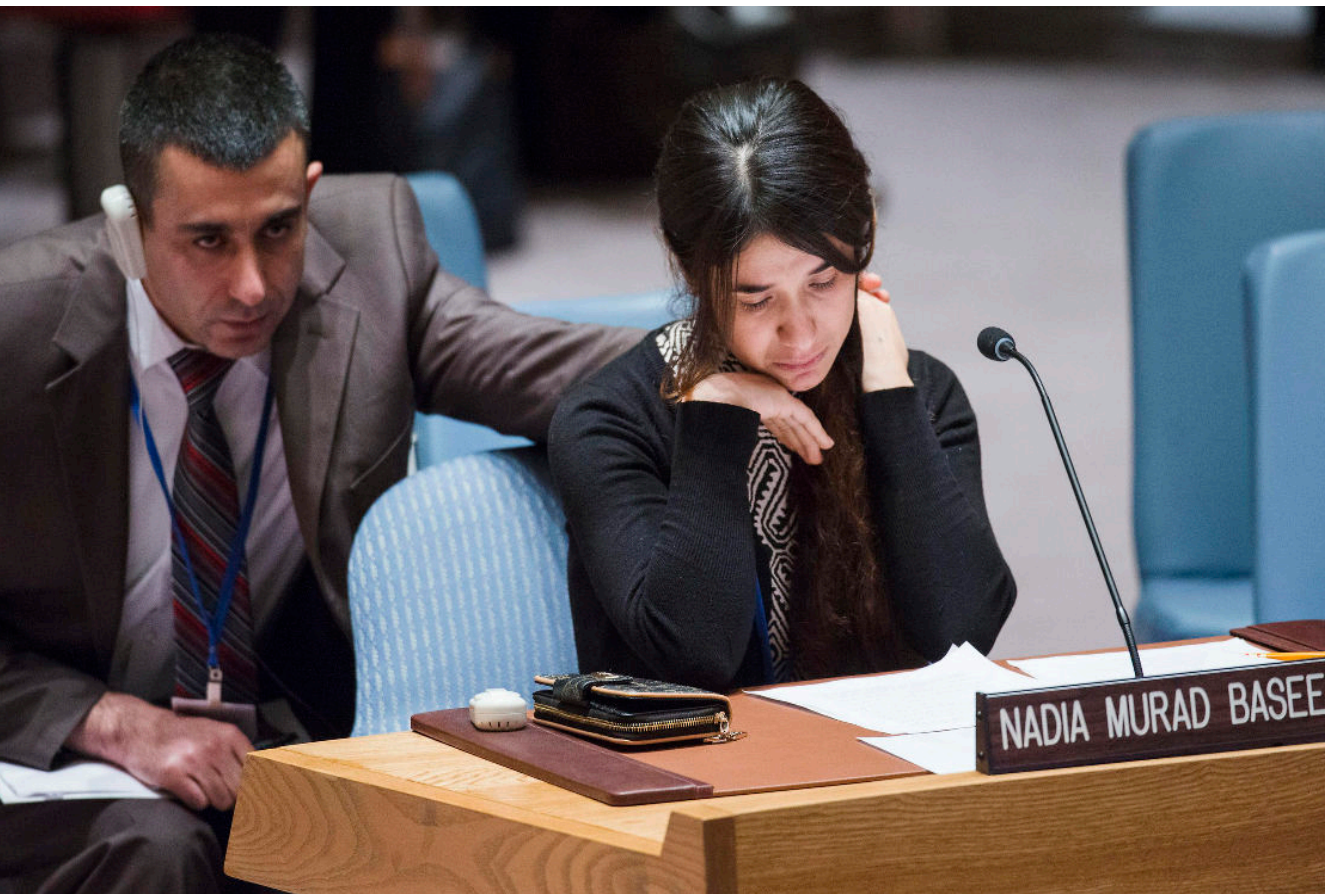
Nadia Murad, a Yazidi woman who escaped Daesh captivity, testifies about her experience in front of the United Nations Security Council. She was awarded the Nobel Peace Prize in 2018 for her outspoken advocacy on behalf of the Yazidis.