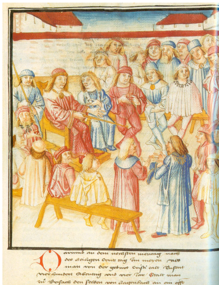
The first Trial for Sexual Violence in Conflict was likely 1474